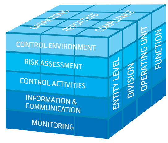
Figure 1: COSO Internal Control Framework

Grameenphone follows a risk-based approach for designing and implementing effective internal controls. Currently, the entire financial reporting of Grameenphone encompasses 18 inter-related processes. Risk assessment exercise is performed for each of the processes on annual basis. As part of the risk assessment, each process is evaluated through probability and impact matrix and categorised into a four-point ordinal scale (Very High, High, Medium and Low). Internal controls are designed and deployed to mitigate identified risks to an acceptable level.